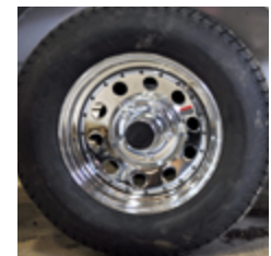
ALUMINUM OUTER WHEELS